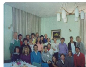
Gawler Meditation Teachers ca 1988